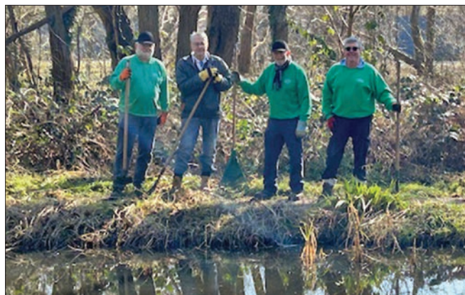
Canal volunteers - near Brookwood

While walking along the canal recently you may have noticed that the banks have been cut back in many places and areas tidied up. The cut back happens at the end of February and throughout March before any birds start nesting along the banks, and this is all done by cheerful groups of volunteers. The BCA has been glad to see a growth in membership in recent months and now have 1,200 members along with many volunteers. There is a Tuesday work party as well as weekend and corporate groups working to keep the canal in good condition and improving habitats for wildlife. The new electric passenger boat, Kitty II, is almost finished and ready to use. The last hurdle is to get shore power infrastructure provision at Bridge Barn which has hit legal problems, hopefully resolved soon. Meanwhile, trips on other boats can be booked on the website http://basingstoke-canal.org.uk/book-your-boat-trip/