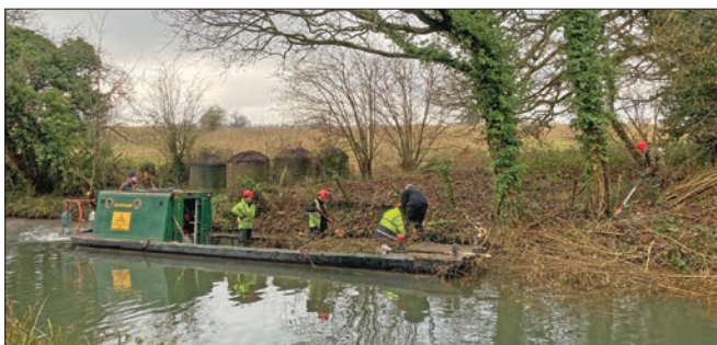
Work party, near Blacksmith's Bridge with previously hidden WW2 defences now exposed